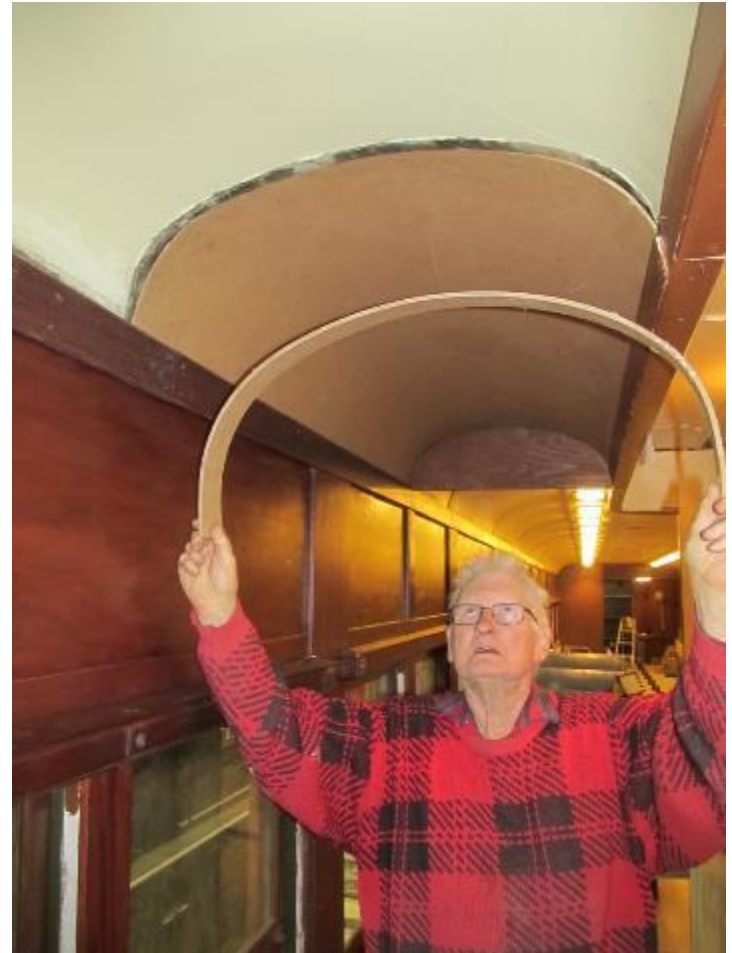
Checking out a piece of curved ceiling trim