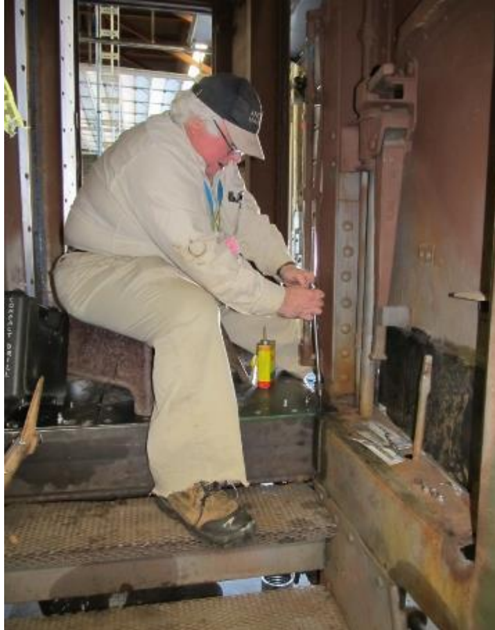
Bottom tapping the holes in the frame to which the deck screws are attached