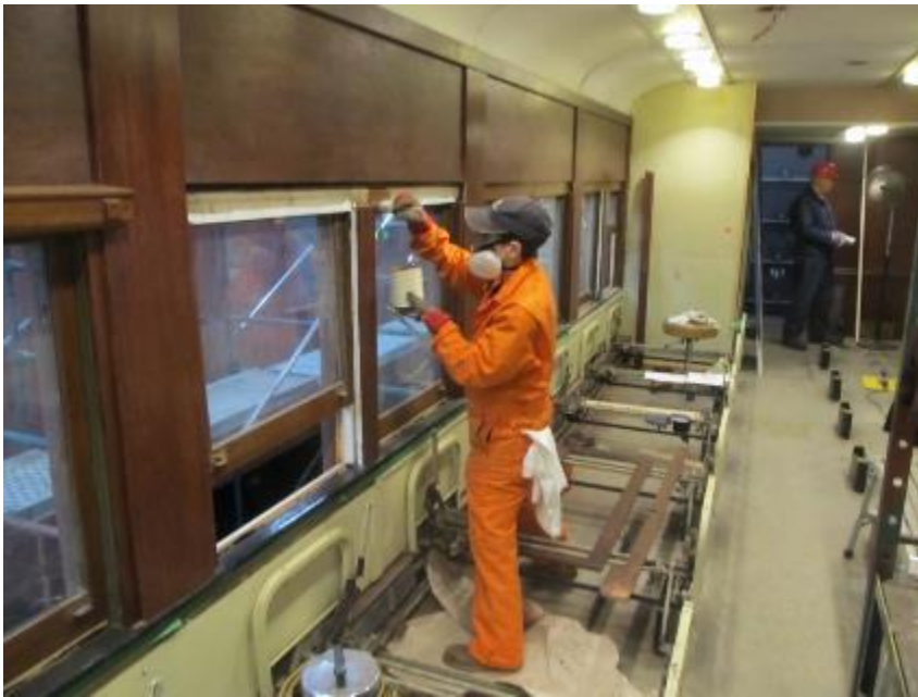
The rough finish beneath the window blind covers is painted brown to conceal the opening