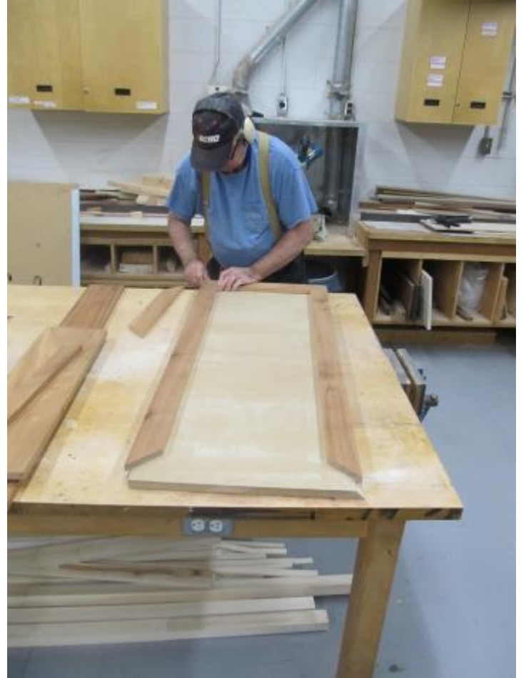
A new door takes shape for the emergency tool cabinet