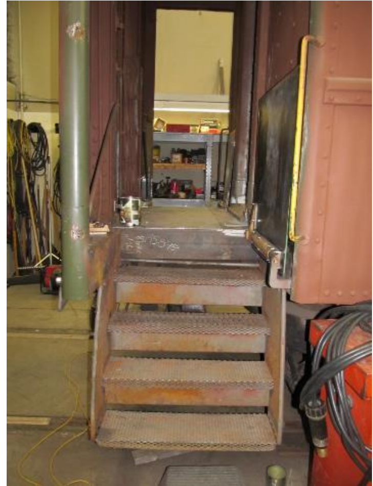
“B” end Vestibule, RHS