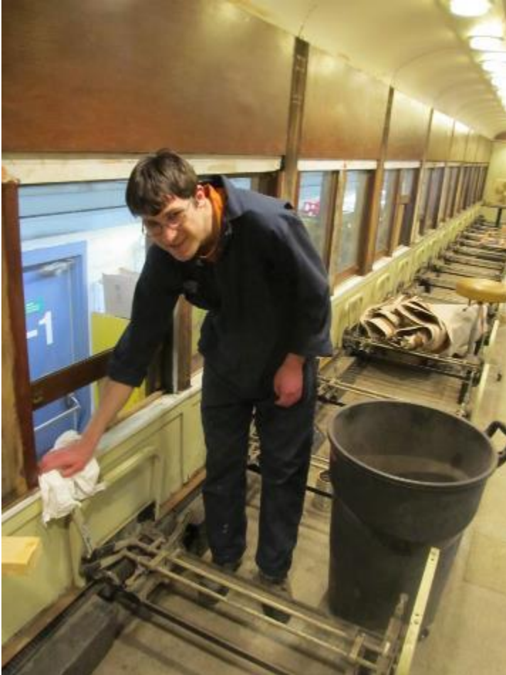
Cleaning the window sills