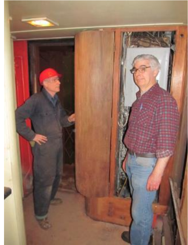
Following stripping the door is returned to the equipment locker