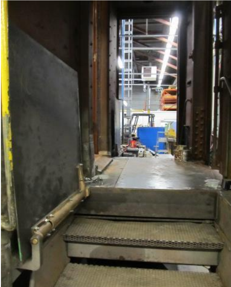
“B” end Vestibule, LHS