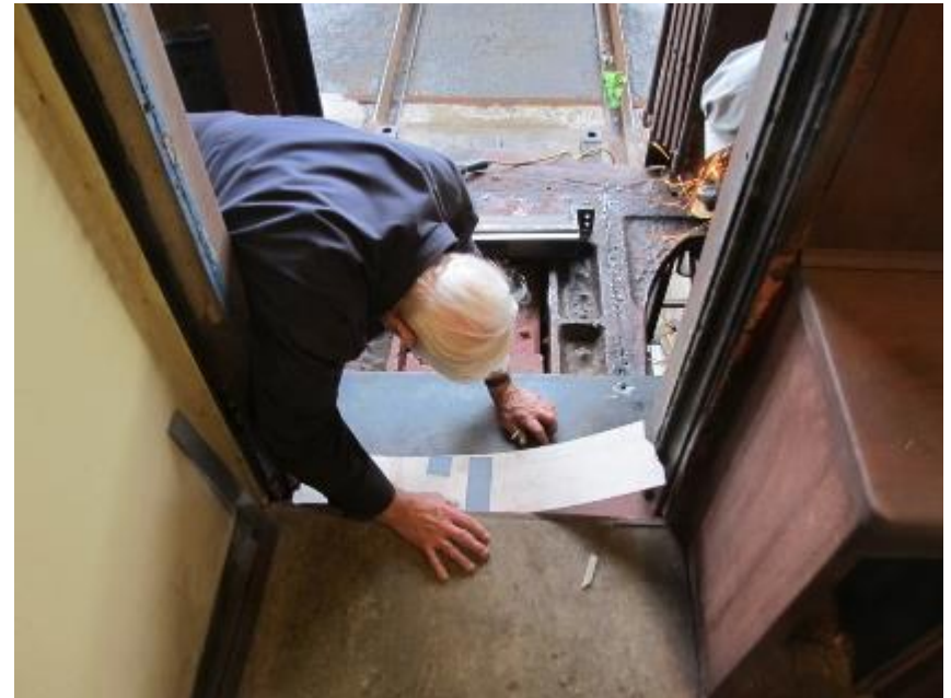
Cardboard is used to trace a pattern for the new door sill and inside floor plate