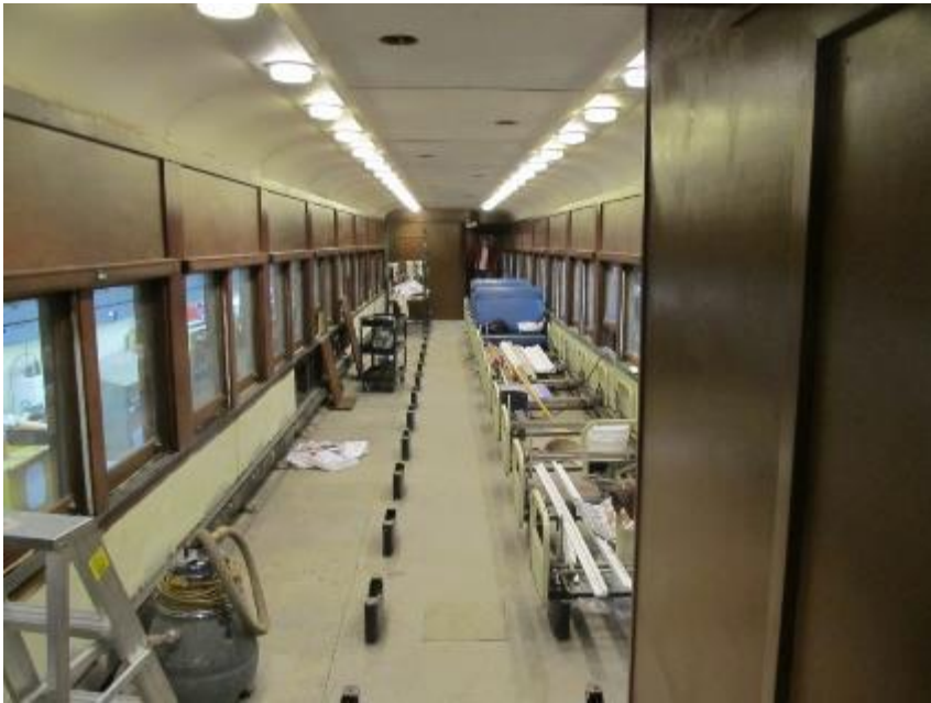
Looking towards the "A" end