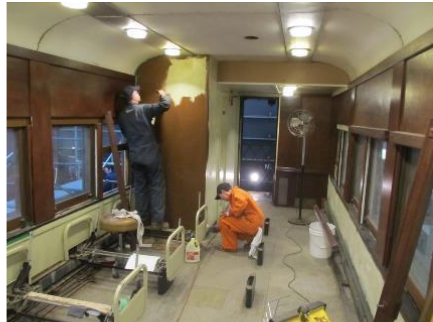
Applying the first coat of brown paint to the "B" end