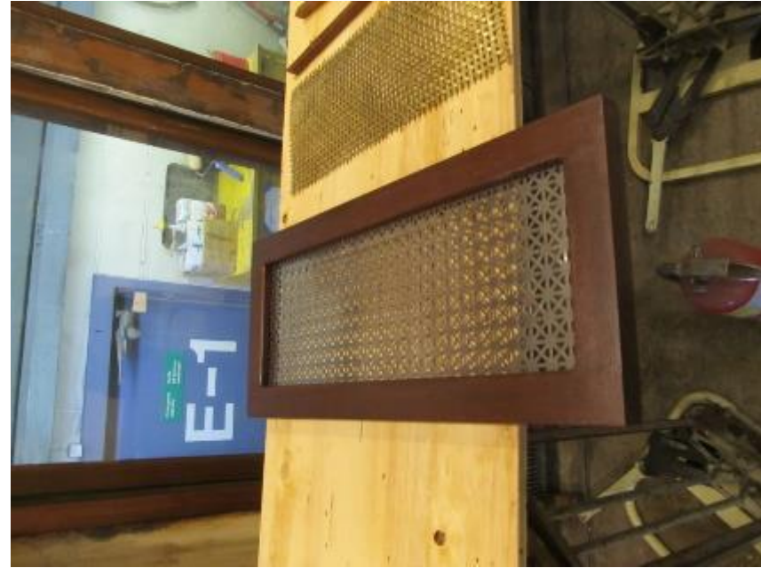
Staining and lacquering involved all sorts of bits and pieces. Here is one of the ventilator cabinet screens