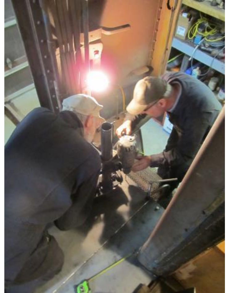
Using a magnetic drill to create holes to hold the top deck