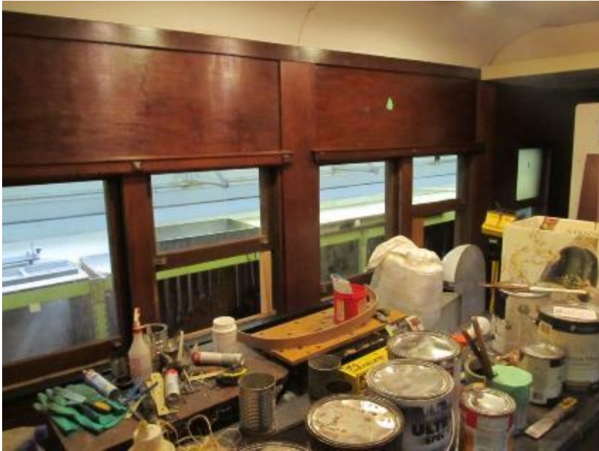
Inside the snack bar / smoker