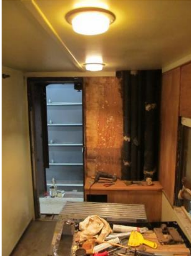
Preparing the “B” end wall, ventilator cabinet and pipe chase