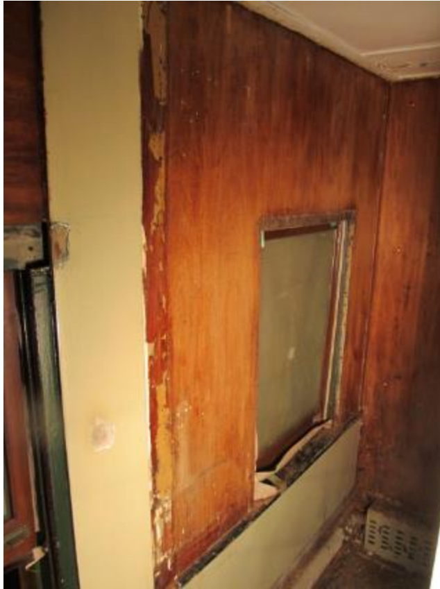
Original finish within the former Men's washroom