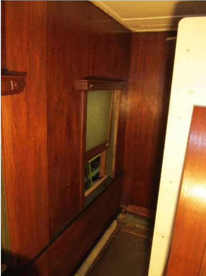
Snack bar / former Men's Washroom