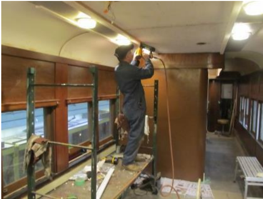
Masonite edging finishes off the centre ceiling trim