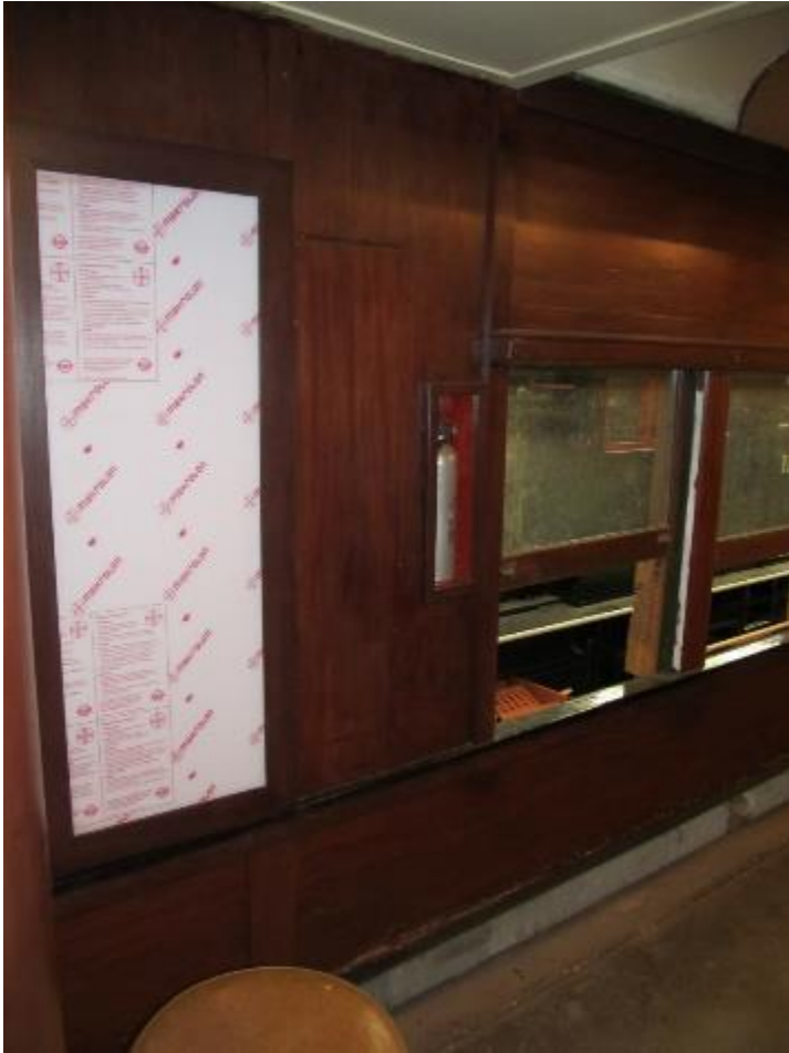
Tool & fire extinguisher cabinets “A” end corridor