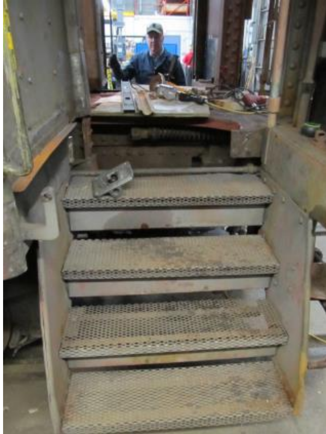
The top step riser on the RHS has been removed