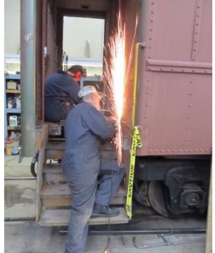
The final adjustment on most of the work involves the angle grinder.