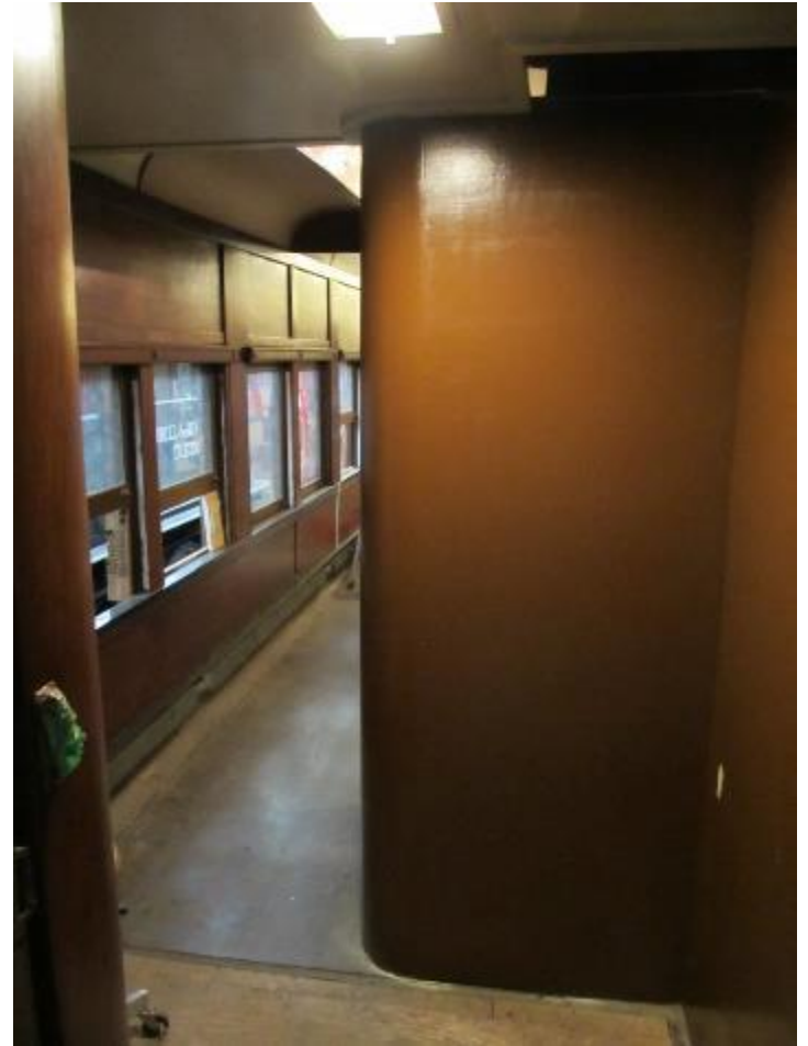
The "A" end corridor