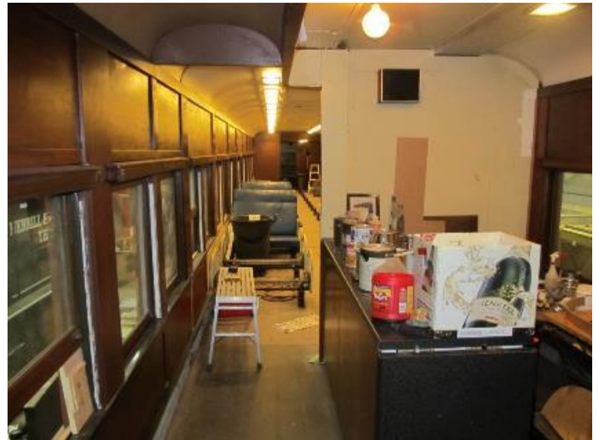
Along the “A” end corridor