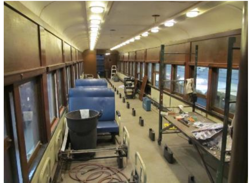
Looking towards the "B" end